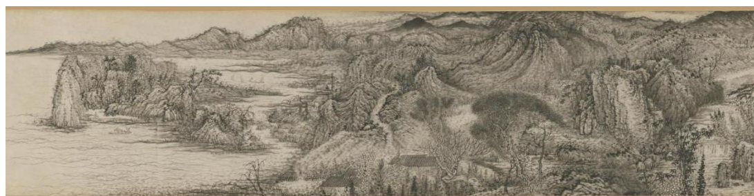
Fig. 5. Sketch of Seeking Out Unique Peaks (part)