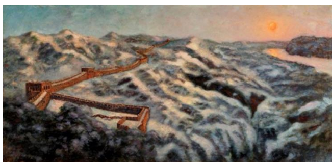
Fig. 4. The Great Wall Yan Wenliang

In his works, Yan Wenliang assimilated Western oil painting techniques for modeling light and shadow while integrating traditional Chinese compositional principles. Shitao's Sketch of Seeking Out Unique Peaks (Fig. 5) utilizes a "Deep Distance" composition, where the undulating mountains encircle sharp peaks and cliffs, with streams winding through, eventually merging into the great river, and mist rising over distant peaks. This composition draws the viewer's spirit into the natural landscape, away from the mundane social world. The Great Wall in Yan Wenliang's painting shares a similar effect with the streams in Shitao's work, extending the viewer's gaze into the distance and igniting the imagination, transitioning from the finite to the infinite. The tangible form of landscapes embodies the "real," while the "distant view" and "distant momentum" of landscapes lead towards the "void". [5 p. 289]