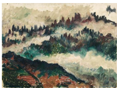
Fig. 1. Liu Haisu Liushutai misty drizzle 1936

Liu Haisu's Liushutai misty drizzle exemplifies this layering effect through the blank space left for clouds, preserving the depth of traditional yijing. Drawing from Western perspective techniques and light and shadow effects, Liu broke away from traditional flat compositions, creating a more three-dimensional and modern aesthetic. Lushan at Hanpo Pass (Fig. 2) is a landscape oil painting created by Liu Haisu in 1956. The work showcases his increasingly adept and confident control of the oil painting medium, drawing heavily on Post-Impressionist techniques regarding perspective, color, and brushwork. In terms of color, the darker areas of the painting also incorporate significant amounts of blue. While Cézanne employed extensive horizontal brushstrokes to portray the undulating contours of Mont Sainte-Victoire, Liu Haisu utilized vertical brushstrokes to convey the towering presence of Lushan Mountain. His rendering of trees similarly reflects a resemblance, indicating Liu's substantial absorption of Post-Impressionist painting techniques in his own work.