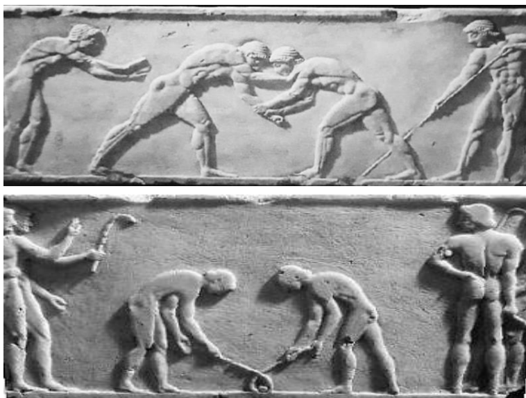
Fig. 4. Greek civilization, Plinth of kouros statue, bas-relief depicting boxers and players with sticks and ball, known as "Hockey players", circa 490 B.C. from Kerameikos Necropolis in Athens, Greece.

The Corinthian style developed in Arcadia in 5 th century B.C. and derived from the Ionic style and in this context sculpture also evolved, being close to sports and fight arena. Gymnastics and athletics sports in general provided artists with models of inspiration and study of the human body 174 . The Olympic Games, whose beginning was marked by an imposing religious procession, lasted for five days, during which in addition to sports competitions, several sacrifices were made for the gods of the Greek Pantheon. The whole show had a sacred significance which was also proved by the sacred peace or ekecheiria 175 which was a period when the Greek cities were forbidden to engage in any kind of armed conflict 176 . Born almost 3,000 years ago on Mount Olympus, the Olympics Games have always been a symbol of the highest human virtues.