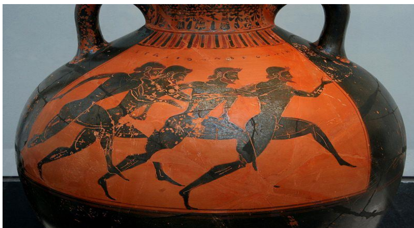
Fig. 3. Greek vase with runners at the panathenaic games, 530 B.C.

The Corinthian style developed in Arcadia in 5 th century B.C. and derived from the Ionic style and in this context sculpture also evolved, being close to sports and fight arena. Gymnastics and athletics sports in general provided artists with models of inspiration and study of the human body 174 . The Olympic Games, whose beginning was marked by an imposing religious procession, lasted for five days, during which in addition to sports competitions, several sacrifices were made for the gods of the Greek Pantheon. The whole show had a sacred significance which was also proved by the sacred peace or ekecheiria 175 which was a period when the Greek cities were forbidden to engage in any kind of armed conflict 176 . Born almost 3,000 years ago on Mount Olympus, the Olympics Games have always been a symbol of the highest human virtues.