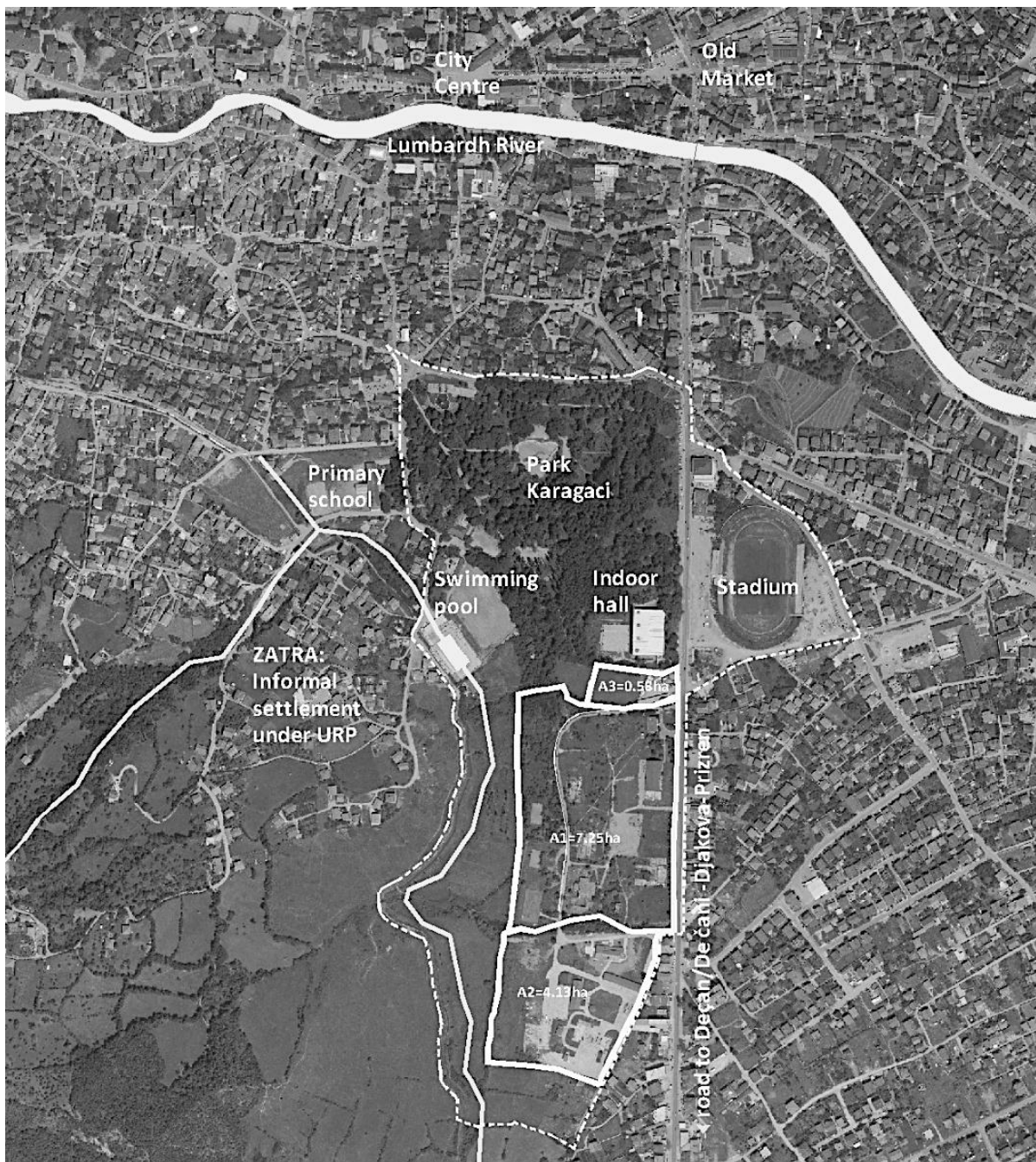
Fig. no. 2. Peja Municipality, location of Zone EST presented at Europan 12

Since now, the Municipality of Peja was in a better position because the planned location for the university campus was used by the Faculty of Business, the Location Vision was defined, the concept of development through international competition was designed, then only the last step remained that all this work be harmonized with the legal framework, respectively with the Law on Spatial Planning. Therefore, the Municipality of Peja makes the decision to draft the Urban Regulatory Plan for the EST Zone, to open the way for the development