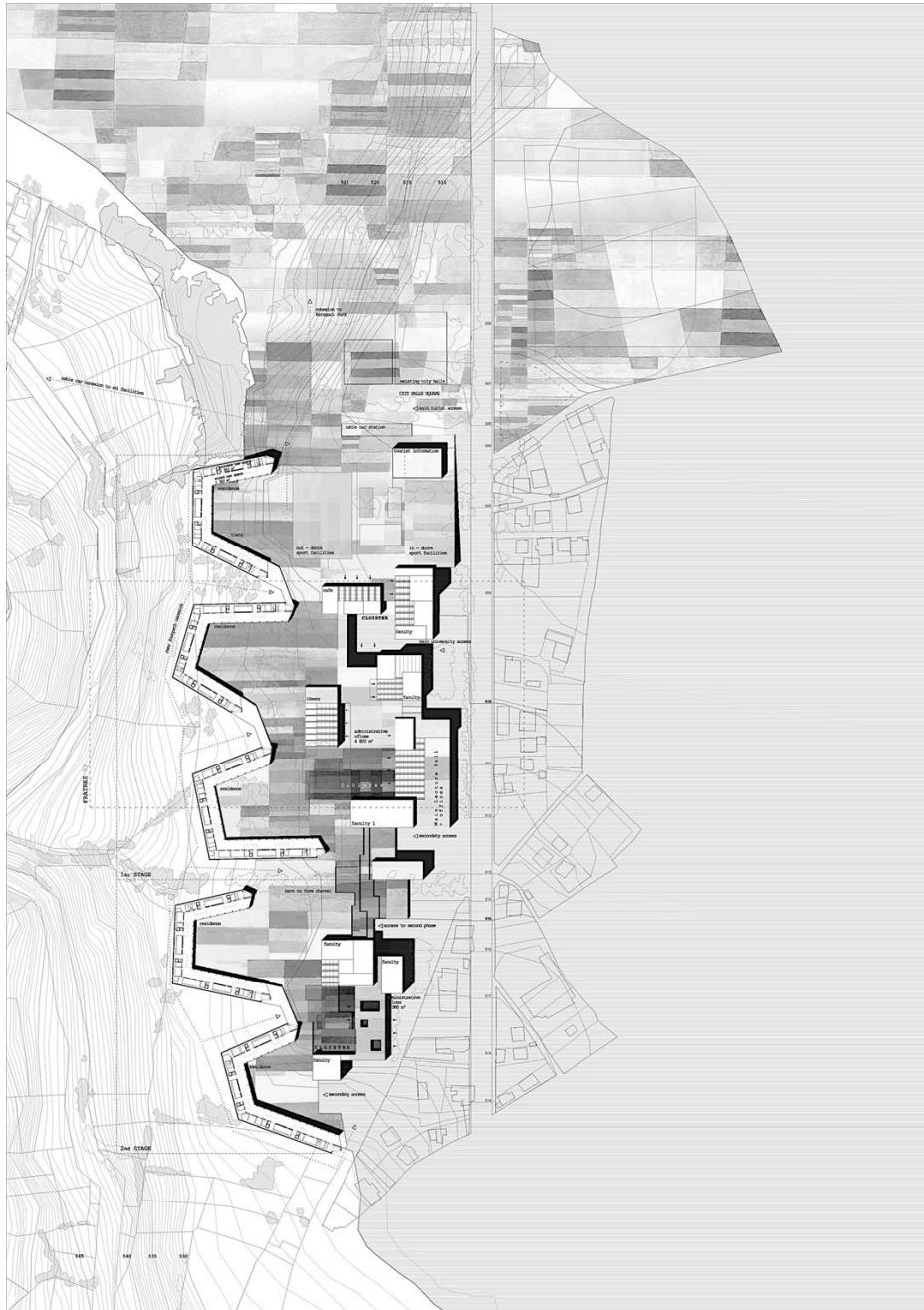
Fig. no 3. Peja Municipality, Urban zone of University Campus

of the University Public Campus, the sports area and the baptized tourist resort named Borea which connects the city of Peja with the Borea tourist center in Kopranik. 253